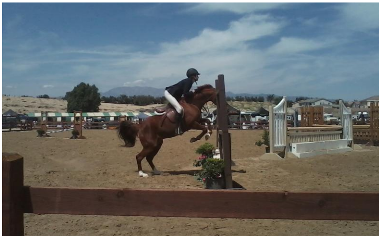
Silverlakes Equestrian Event on April 3 rd !